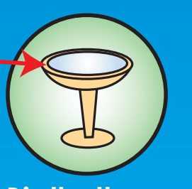
Birdbath (Change water twice a week)